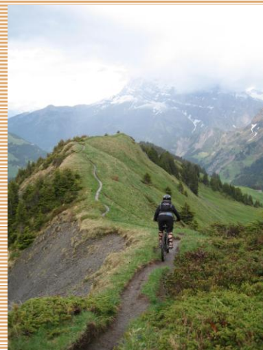
Twisting Ridgeline Decent

Check out offers for our Yoga and Wellbeing retreat at www.holygrailmtb.com/yoga