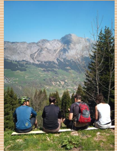
Stopping for lunch on the Mont De Grange.