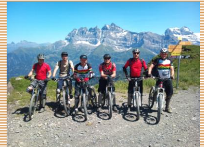
The French/Swiss Border.