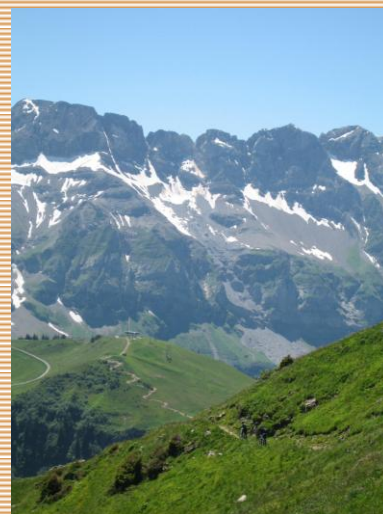
Epic Swiss Terrain.