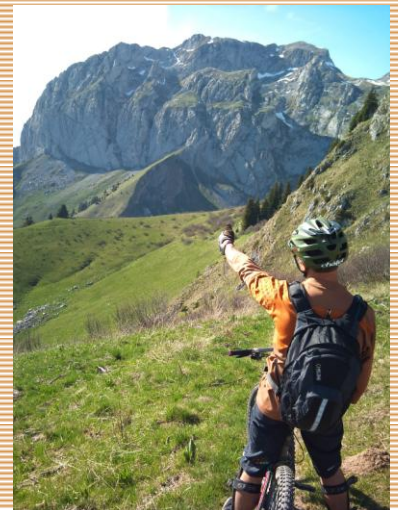
New Route Finding, I think it goes???